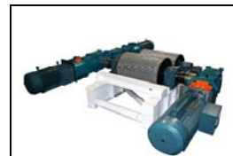
Triple 500HP Alignment free VFD Belt Drive