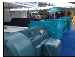
300HP Alignment-Free Belt Drive