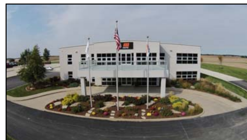
Martin Engineering Center For Innovation