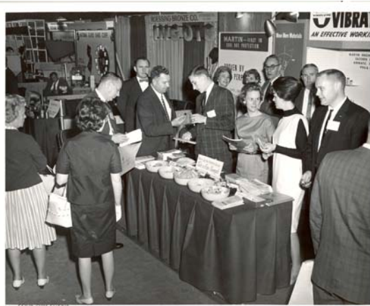
Booth at the 1964 Foundry Show in Atlantic City

Neponset, IL – Martin Engineering , a global innovator in bulk material handling is celebrating 70 years of designing high-quality equipment and accessories, serving customers in a wide range of industries around the world. Along with spearheading efforts in safety and education, Martin Engineering has had a profound impact on efficient operations in coal, cement, aggregate, biomass and other industries across 6 continents. This has earned the company a reputation for excellent customer service and long-lasting equipment, which carry the best warranty in the industry.