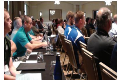
CEMA 2018 Engineering Conference

If you do, then contact CEMA about membership and I look forward to seeing you at the CEMA Engineering Conference.